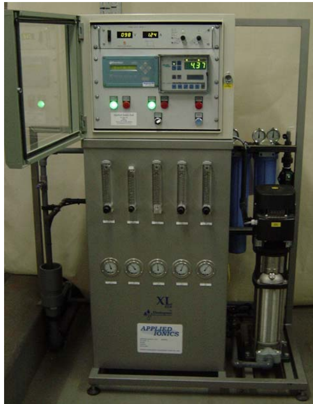
AIRE500—500 LPH SYSTEM

APPLIED IONICS REVERSE OSMOSIS / ELECTRODEIONISATION SYSTEMS CAN BE CONFIGURED TO SUIT ALL YOUR HIGH PURITY WATER NEEDS.